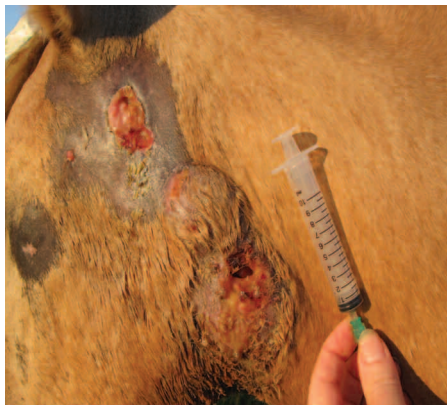
Abscessed lymph nodes at the base of the head

Even if you take all the necessary precautions, there is still a chance a horse may become infected with S. equi , especially as some horses