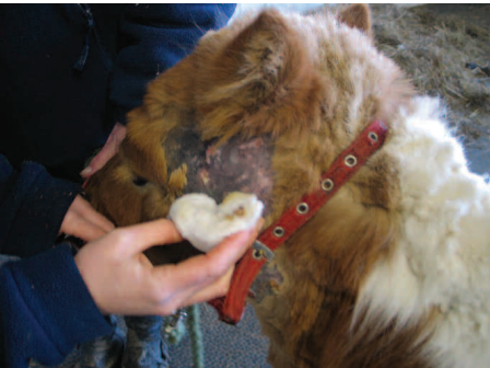
Abscessed lymph node discharging infected pus

water should be discharged to the sewer or septic tank to avoid cross contamination.