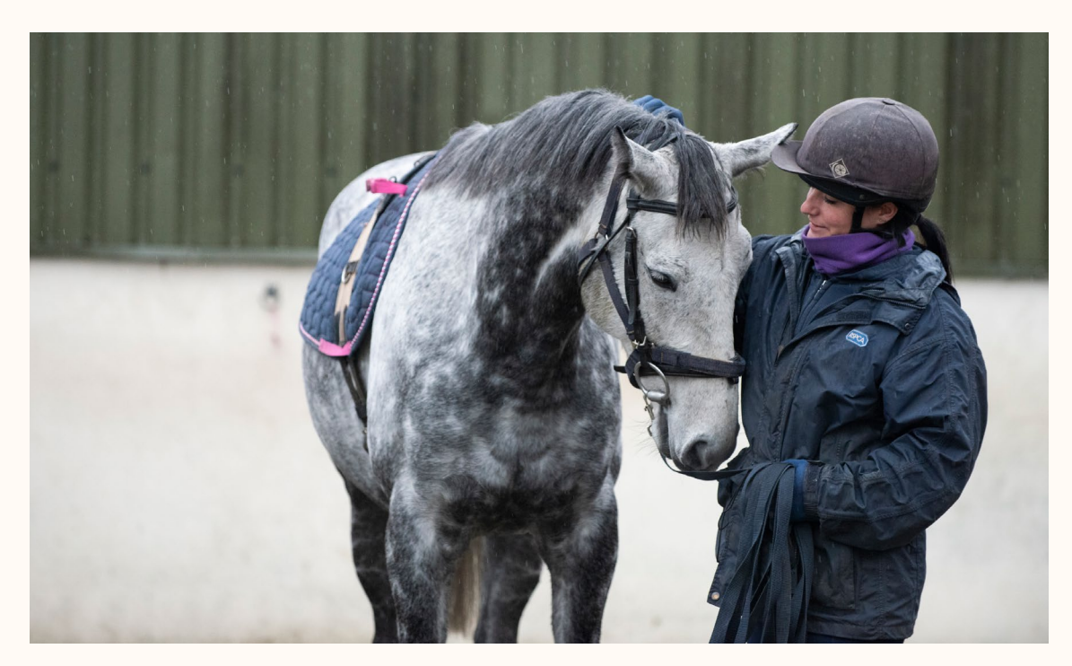
Figure 4. A Thoroughbred horse at RSPCA Felledge Equine Centre.

3) The lack of equine-keeping facilities with adequate provision for turnout, grazing and socialisation leading to unfulfilled welfare needs and fewer opportunities for positive welfare.