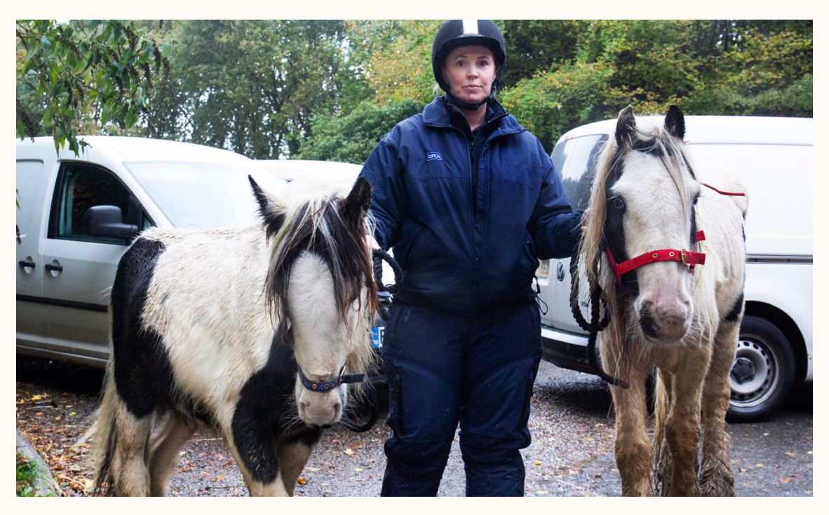
Figure 5. Small cobs, part of an RSPCA rescue following a report of neglect in 2020.

(see Figure 6). Participants reported an absence of experienced and knowledgeable yard managers, further compromising equine welfare when inexperienced or uncertain owners had no one to ask for appropriate advice. This was compounded by the absence of licensing meaning that, unlike riding schools, anyone can open a livery yard and offer livery services for horses.