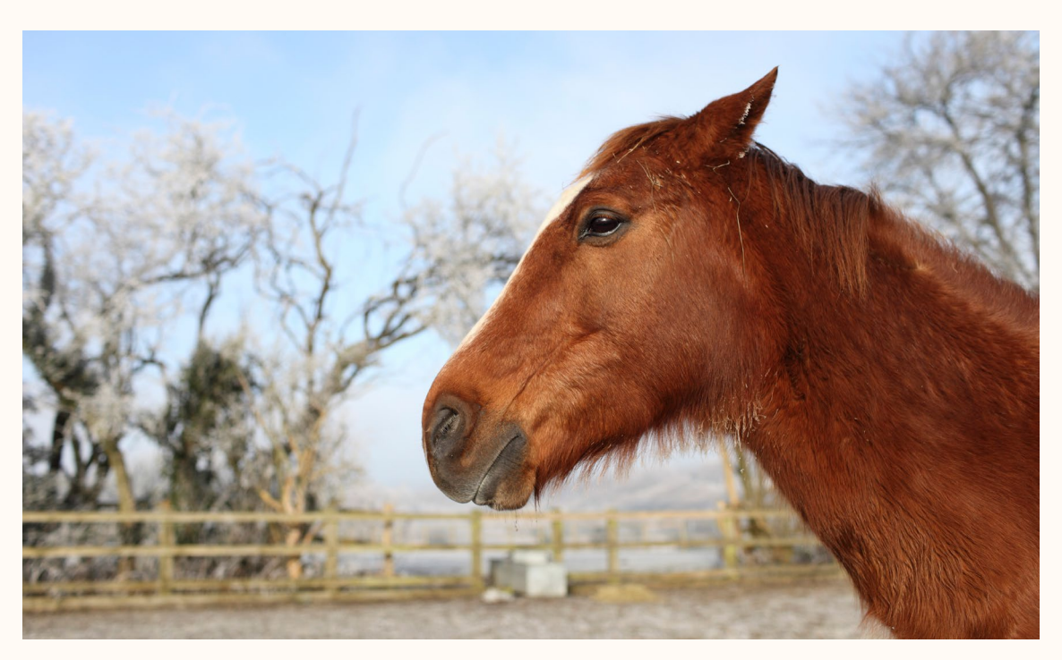
Figure 3. Horse showing facial signs of stress and pain – note the head held high, ears back, tension in the mouth and jaw and the inverted v-shape above the eye. Poor recognition of these signs by horse owners means that stress and pain go undetected and untreated.