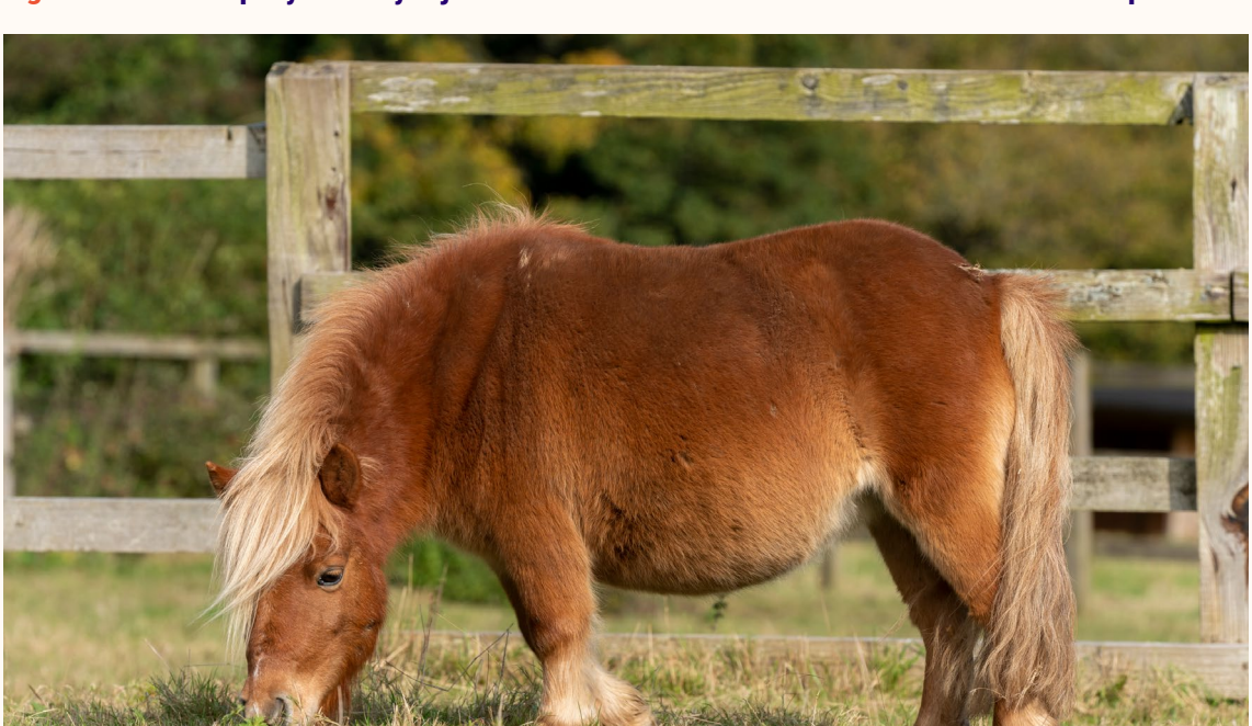
Figure 2. An obese pony. Obesity is just one of the diverse welfare issues identified in the report.

Our research has identified evolution of the original equine overpopulation crisis to a widespread failure to meet the welfare needs of equines. For this reason, our research proposes renaming the 'horse crisis' the 'equine welfare crisis' [9]. Finally, there is a strong argument, put forward in Britain's Horse Problem (2020)<sup>[10]</sup>, that as a persistent cycle of equine welfare need, the former crisis can no longer be deemed as such but must be recognised as a systemic failure of ownership and enforcement. The findings of our research support this conclusion.