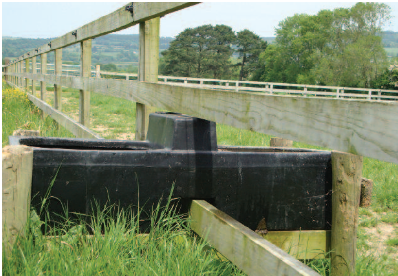
Water trough placed in the fence line.

A handbook on best grazing/forage management practices and techniques