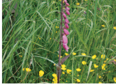
FOXGLOVE (Digitalis purpurea)

This is a highly poisonous species and horses will rarely eat it, except in hay. Some 120-150g can be fatal.