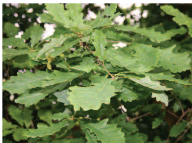
OAK ( Wuercus spp. )

Leaves and acorns can cause digestive upsets, but large amounts are needed; they rarely cause death.