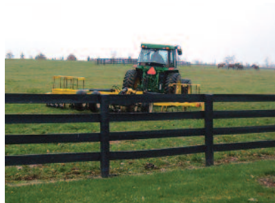
Pasture being aerated.