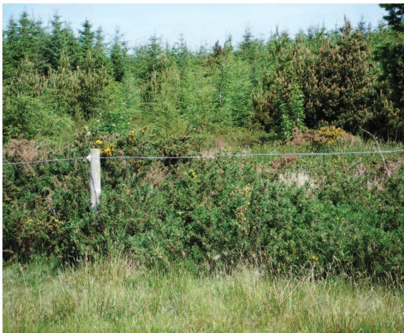
Electric fence single cable used effectively with a natural boundary.

suitable to use when grazing horses with sheep. The gaps in the fence are smaller than with common sheep fencing to prevent both horses and foals putting a foot through it. Electric horse cable fencing is one of the cheapest options but is not ideal as a sole divider due to poor visibility. Where possible, it is more suited to use in association with a natural boundary behind it or in conjunction with post and rail fencing.