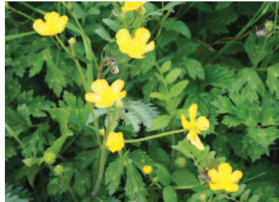
BUTTERCUP (Ranunculus spp.)

These are common in heavily grazed horse pastures in latrine and wet areas but are usually avoided by horses; contrary to popular opinion, buttercup is not a sign of acid soil, but may be an indication of 'horse sickness'. They are mildly poisonous, but are safe in hay.