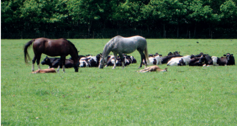
Broodmares grazing happily alongside cattle.

Grazing management includes fertiliser applications to maintain and improve sward quality and to provide a steady supply of grass throughout the season. But, it also includes the stocking policy, treatment of the grass, and weed control programme through the year. It is necessary to regulate excess grass production in the spring with higher stocking densities, using other classes of stock if necessary, and by topping or closing up some areas for cutting hay or haylage.