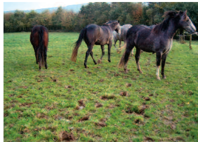
Pasture that has been badly poached due to over-grazing in wet conditions.