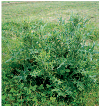
Spear thistle rosette stage.

A handbook on best grazing/forage management practices and techniques