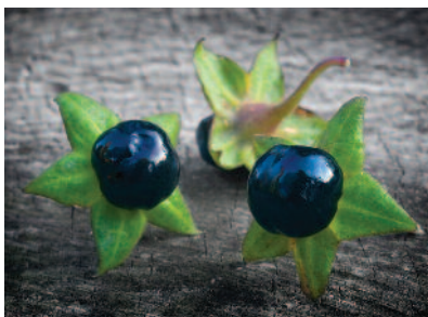
DEADLY NIGHTSHADE ( Atropa belladonna )

A number of common garden plants, hedging and shrubs are dangerous to horses and must be monitored for their presence in grazing areas. As outlined earlier, many garden trees are poisonous, among which are: laburnum, alder buckthorn, common alder, holly, juniper, cherry laurel and daphne laurel. Also, box, privet, rhododendron, robinia, thuja and St. John's wort. Other plants and trees are dangerous to horses, and it is important to be aware of them, including: