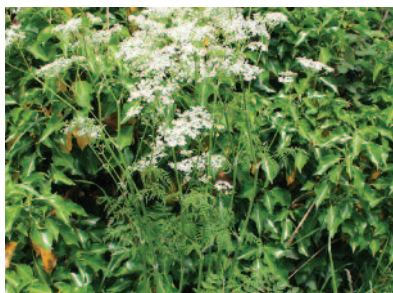
HEMLOCK ( Conium macula tum )

Found in wet conditions, on river banks, etc. Rarely eaten, but is highly poisonous and can be fatal. Hemlock is large and white-flowered with characteristic purple blotches on the stem.