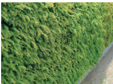
YEW ( Taxus baccata )

This is highly poisonous. The effect is variable, but as little as 150g of fresh leaves are fatal.