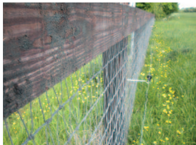
Left and right: Wire mesh fencing.