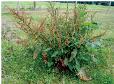
With seed heads.