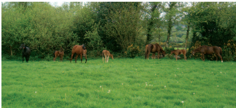
Even, leafy and palatable sward free from harmful weeds.

Over-grazing of paddocks by horses results in 'horse-sick' pastures. These have poor quality grasses, unproductive and harmful weeds, and a high population of parasites, resulting in an unbalanced diet for the horse. Well-managed grassland provides an even, leafy and palatable sward, free from harmful weeds, producing a balanced diet.