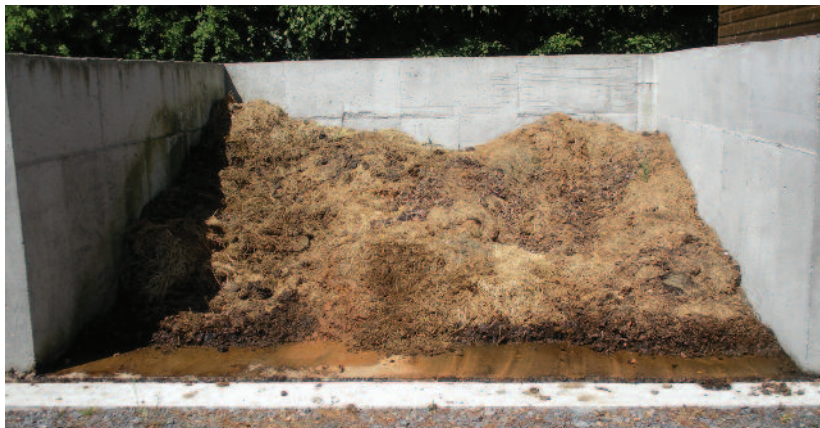
Purpose-built manure pit with channels diverting run-off to a holding tank.

A handbook on best grazing/forage management practices and techniques