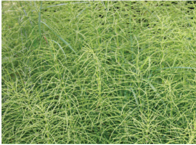
HORSETAILS (Equisetum spp.)

A handbook on best grazing/forage management practices and techniques