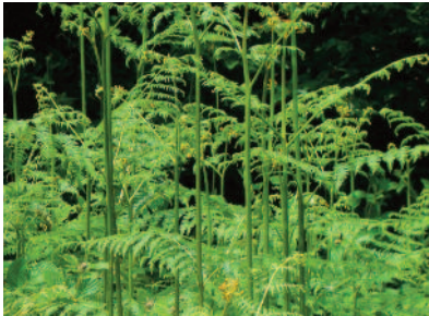
BRACKEN (Pteridium aquilinum)

This is a species of damp conditions. It is poisonous to horses, although horses are unlikely to eat it and large amounts are needed for clinical symptoms to occur. Death is rare and vitamin B1 is an antidote.