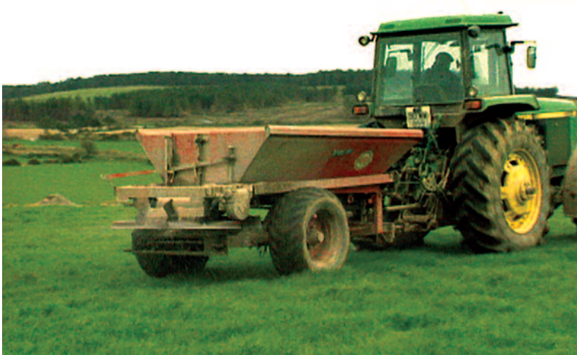
Spreading lime is done to increase soil pH and improve the fertility of soil.

*Increase/decrease P application by 4kg t/DM, K application by 25kg t/DM.