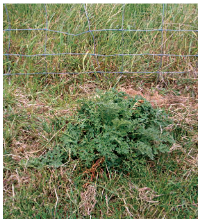
Ragwort rosette stage year one.

A handbook on best grazing/forage management practices and techniques