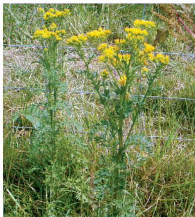
Flowering adult plant year two.