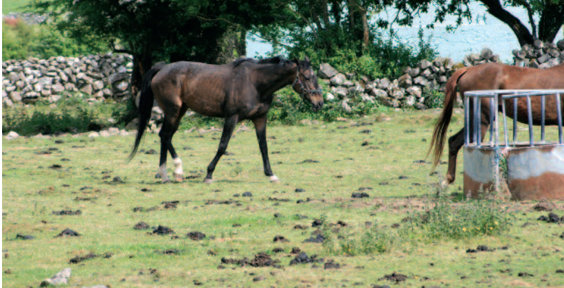
Poor quality grazing and hazardous feed trough.

A handbook on best grazing/forage management practices and techniques