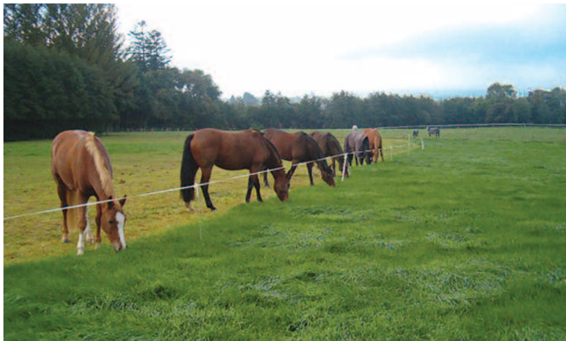
Strip grazing to control consumption. Remember water and shelter provision with strip grazing.

A handbook on best grazing/forage management practices and techniques