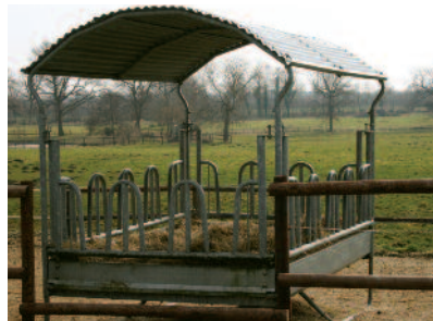
Left and right: Purpose-designed safe feeders for horses.