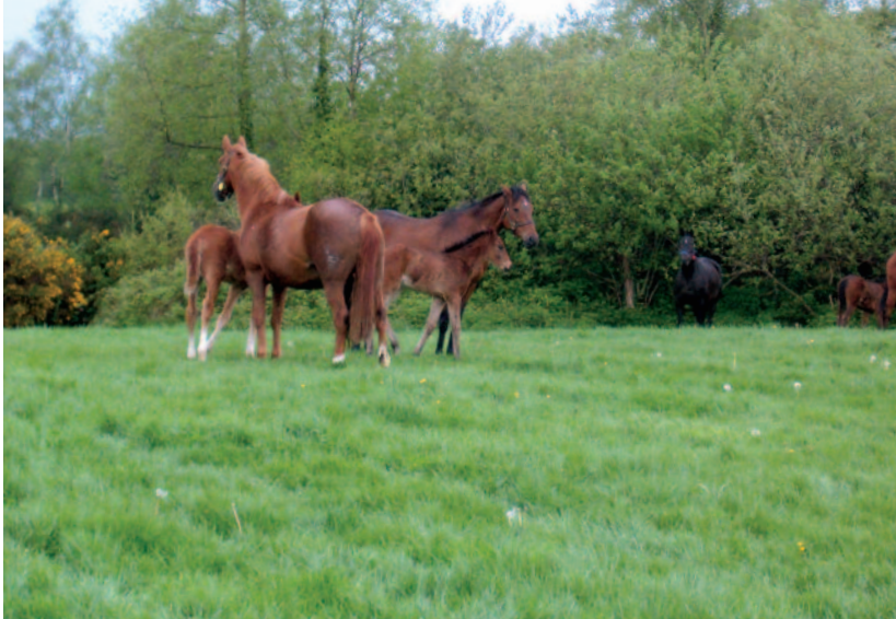
Hedges and trees provide excellent shelter for mares and foals.

A handbook on best grazing/forage management practices and techniques