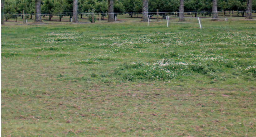
Grazing habits – evidence of lawn and roughs.

The objectives of managing grass for horses are to provide: