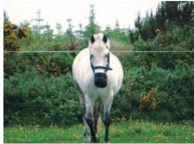
Left and right: A correctly fitted grazing muzzle to control the intake of overweight horses/ponies or those prone to easily gaining weight.

In their natural environment, horses have free access to food and eat as they move around. Keeping horses at pasture is the most natural way of management, replacing grass with preserved forage such as hay or haylage during the winter months when the grass stops growing. During the summer months, access to pasture may need to be restricted by using strip grazing or bare paddocks with low energy forage to avoid excess weight gain. Excess weight at pasture can become a problem, particularly with our native breeds of horses and ponies, and in instances where stocking numbers are too low and there is no access to rotational or mixed grazing. Being overweight affects health, particularly in foals and youngstock. Breeders and owners are advised to be vigilant of body condition. Observe closely the overall shape of the horse or pony. Body fat tends to be laid down in specific areas. Assess the fat covering along the neck, withers, behind the shoulder, over the ribs, tail head and along the top-line. Note that the abdomen (belly) is not assessed as its shape is affected by factors other than body fat, such as gut fill.