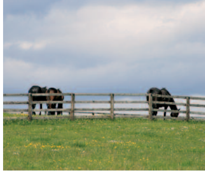
Left and right: Post and rail fence with single line electric fence.