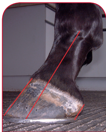
FIGURE 3: A STRAIGHT HOOF PASTERNAxis

A long toe/low heel conformation increases the loading on the back of the foot, predisposing the horse to pain, inflammation and damage to the navicular bone and