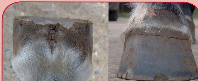
FIGURES 4 AND 5: MEDIO-LATERAL HOOF WALL ASYMMETRY AND IMBALANCE

Medio-lateral imbalance (figures 4 and 5) leads to uneven loading of the internal tissues of the foot, with the resultant accumulation of damage, causing inflammation, injury and lameness.