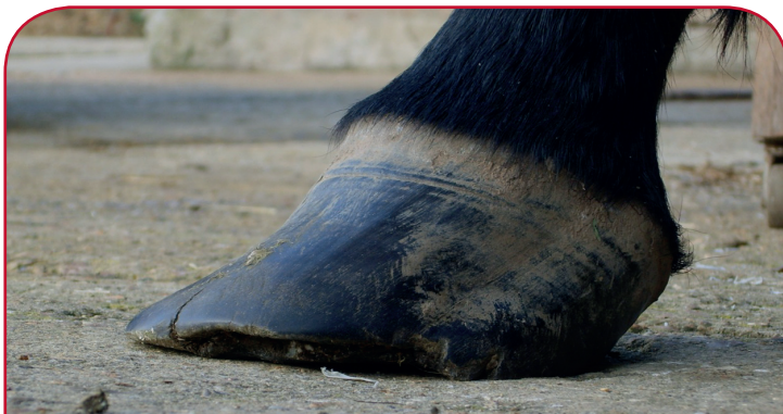
FIGURE 2: AN OVERGROWN FOOT WITH A LONG TOE AND DISTORTED HOOF CAPSULE

This means that as the hoof grows longer it also grows more forward, thus increasing the overall length from the fetlock (figure 2). Significant increases in length and/or distortion of the foot shape can result in lameness both from within the hoof and structures further up the limb. Regular trimming and correction of distortions is vitally important for maintaining soundness.