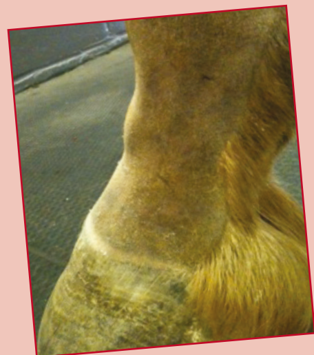
SWELLING OF THE FRONT OF A PASTER N JOINT AFFECTED BY ARTHRITIS